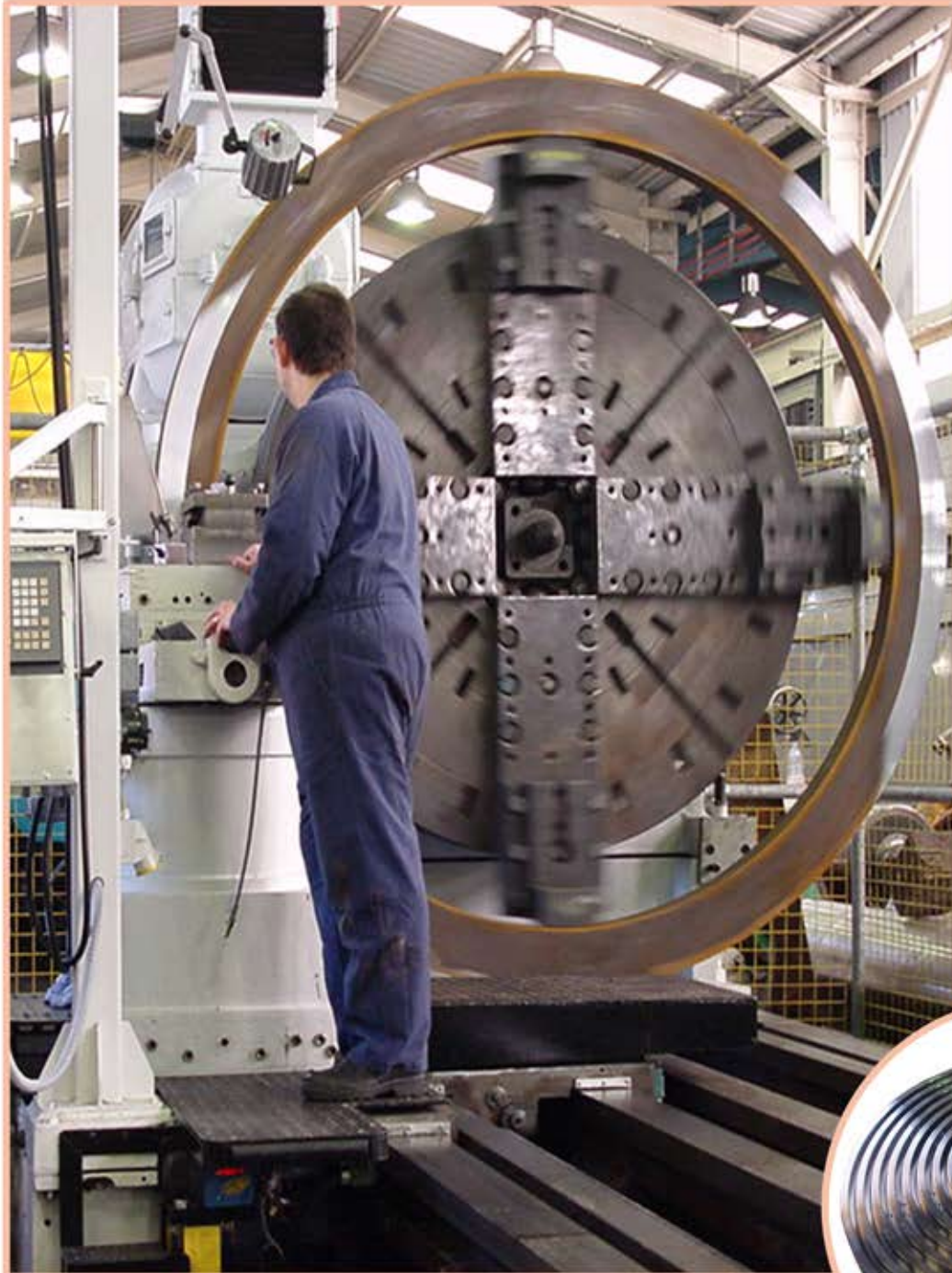
2.5 M DIAMETER SEALING RING