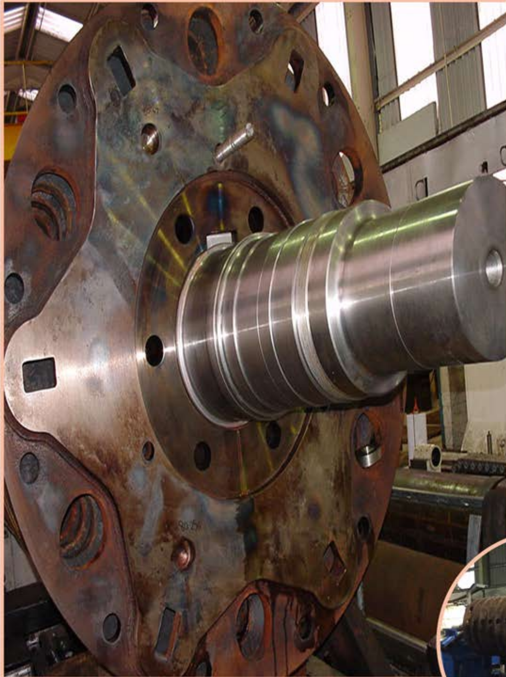
NEW SHAFT FOR 6000 HP FRAGMENTISER