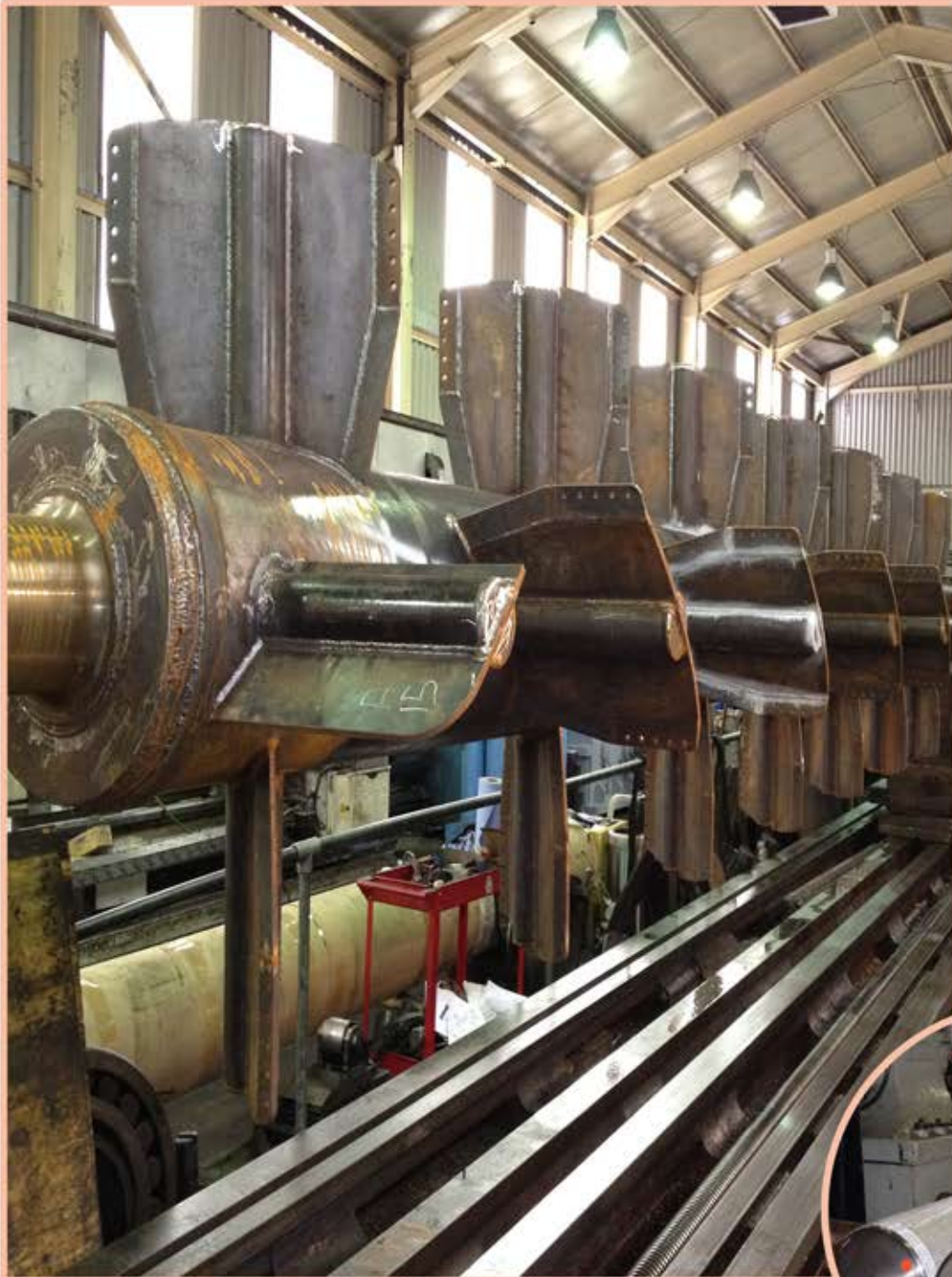
10 M LONG MIXING PADDLE