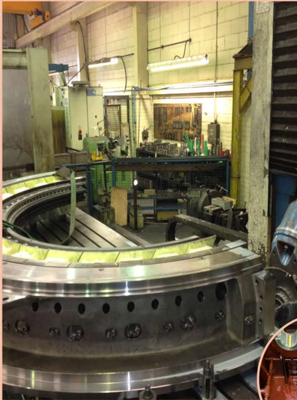
MACHINING OF TURBINE SHROUD