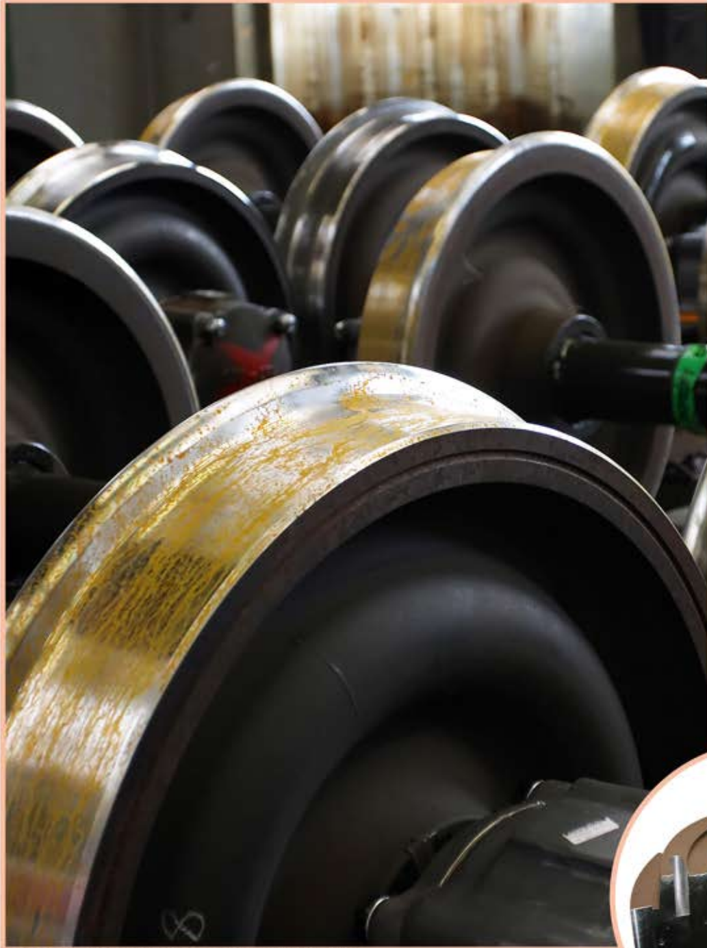
WHEEL AND SHAFT ASSEMBLIES