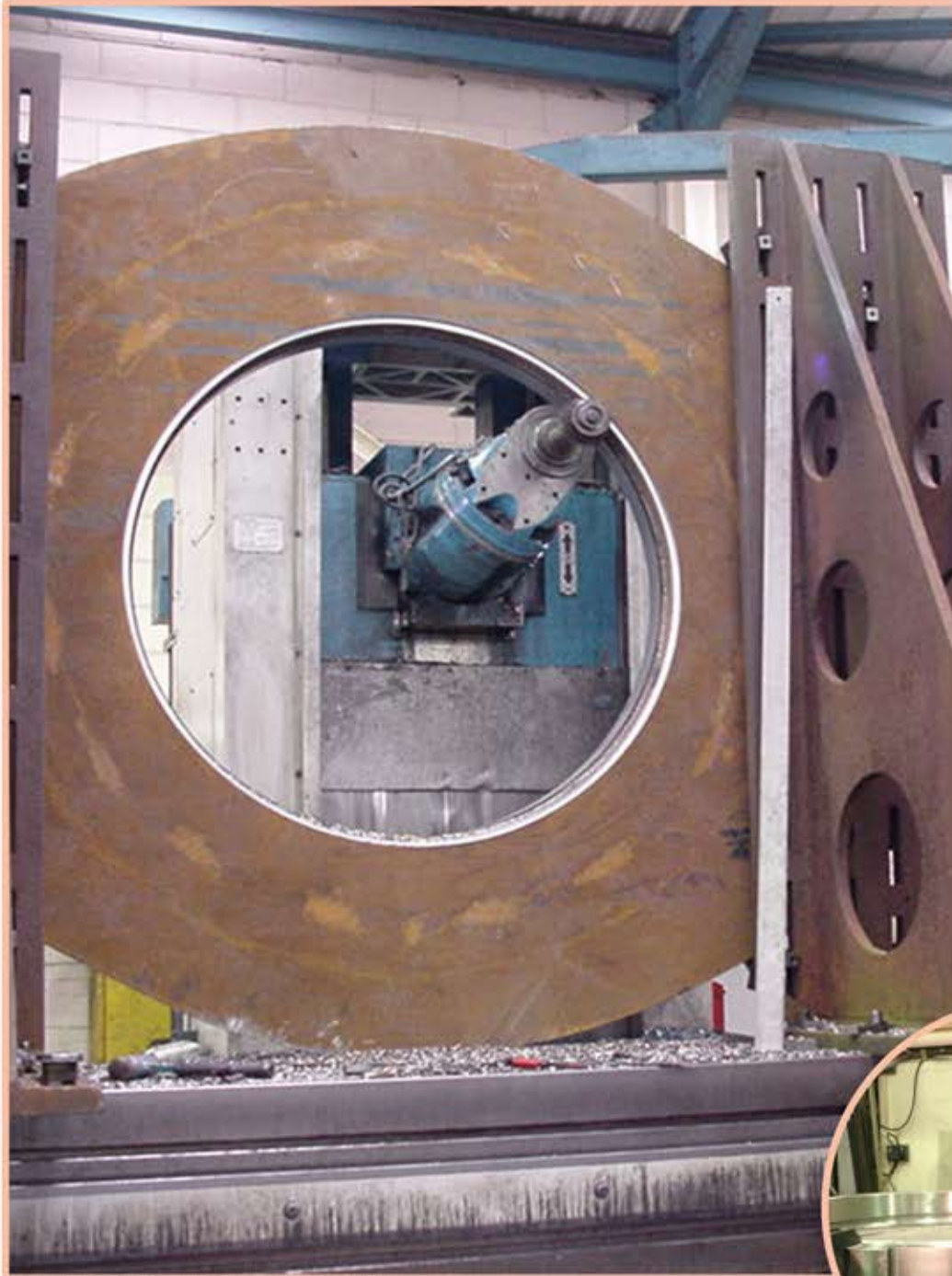
2 M DIAMETER STEEL RING