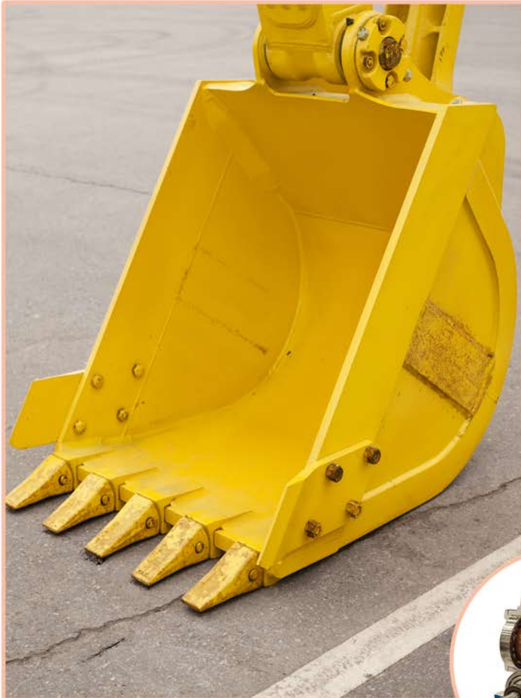
EXCAVATOR BUCKET REPAIRS INCLUDING NEW PINS & BUSHES