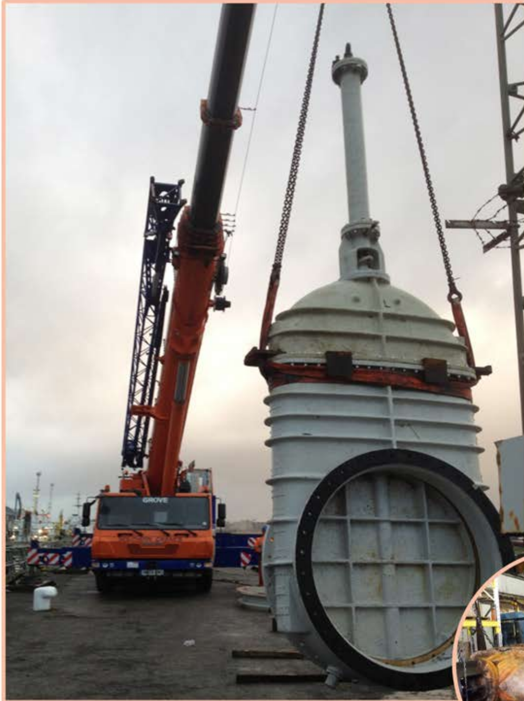
72" SLUICE VALVE READY FOR INSTALLATION